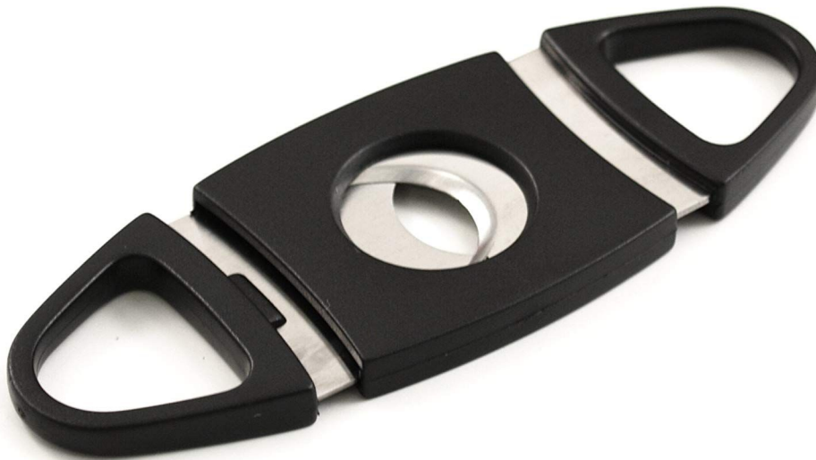
Figure 2: Guillotine Cigar Cutter (Amazon.co.uk, 2018)

Connected to the output of the collector is 12-18 inches of tubing, which will be formed into a tight spiral. when the solder is pushed through the tubing, it will keep its spiral shape. This is optimal for dispensing, since we don't want the user to have access to the solder until after it is cut. The cutter is made up of two servos, with a design very similar to a cigar cutter (Figure 2).