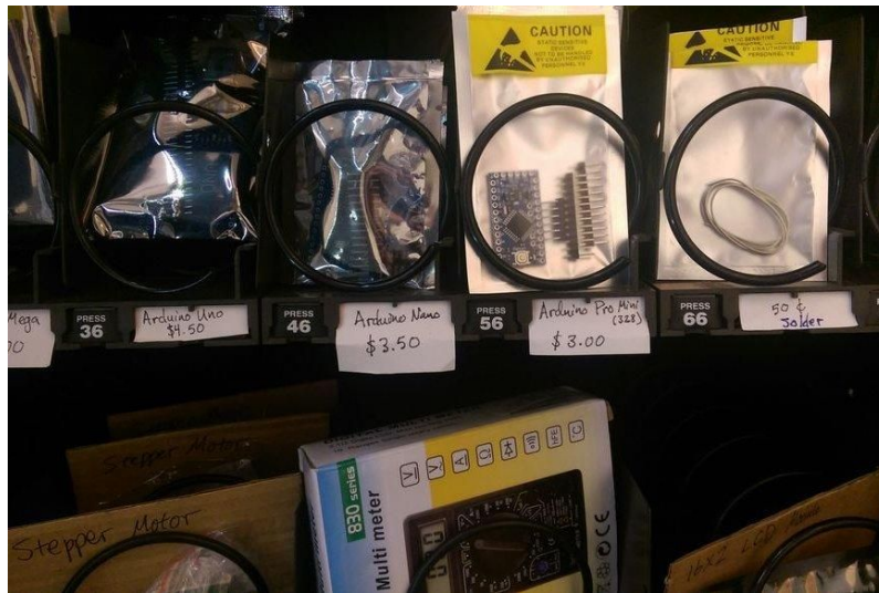
Figure 1: Electronic Parts Vending Machine (Bell, 2018)